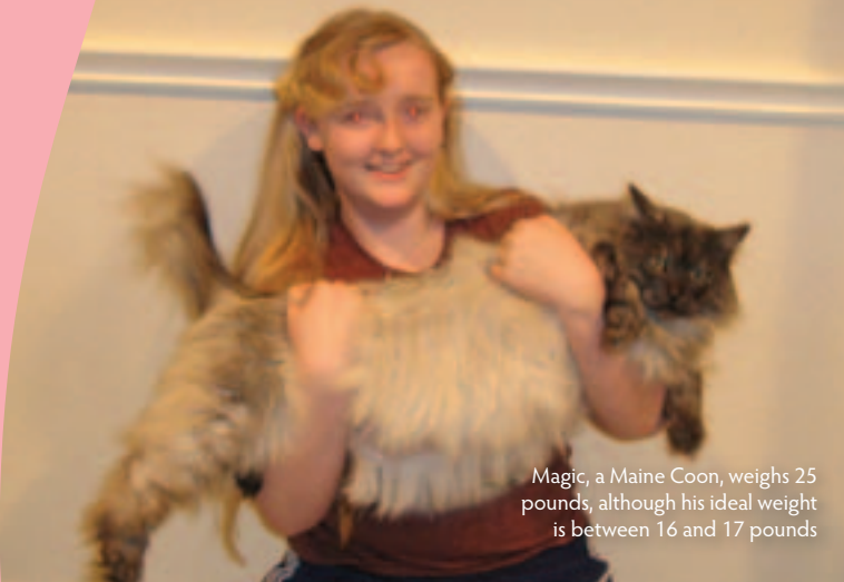
Magic, a Maine Coon, weighs 25 pounds, although his ideal weight is between 16 and 17 pounds