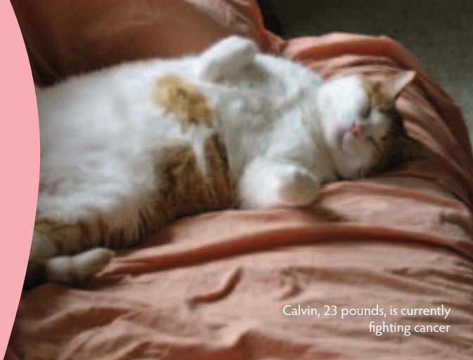
Calvin, 23 pounds, is currently fighting cancer