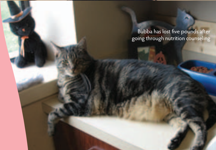
Bubba has lost five pounds after going through nutrition counseling